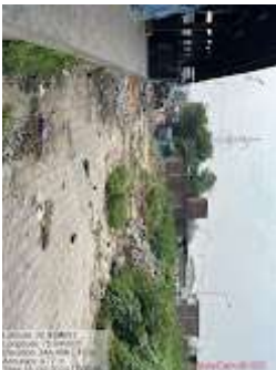
Garbage at Wholesale Vegetable Market.jpeg 418K