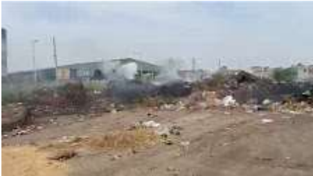
Burning of Garbage at Wholesale VM.jpeg 81K