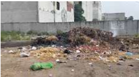
Burning of Garbage at Wholesale VM-2.jpeg 112K